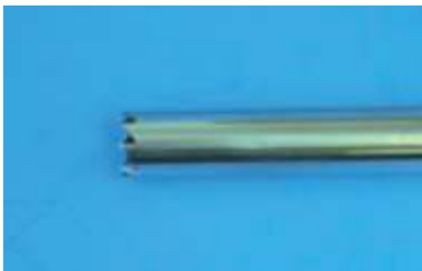
Above- Sharp cutting tip